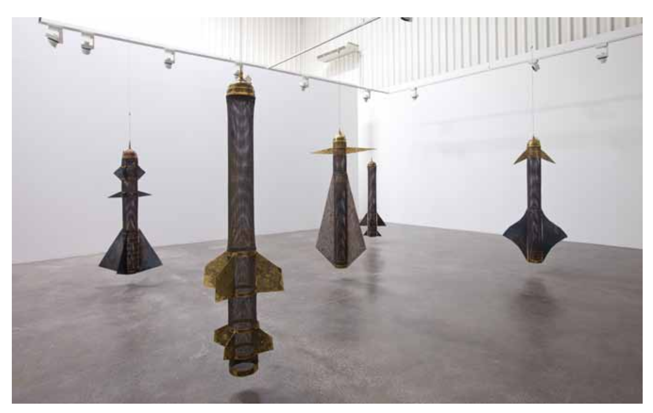
From the Gallery

Belief in a rumor that the tribes to the east had joined forces and forged weapons deadlier than the world has seen and that even then the hooves of their scouts had been heard in the southern hills. The year ended fraught with the fear of war. Next year began with baleful auguries. [1]