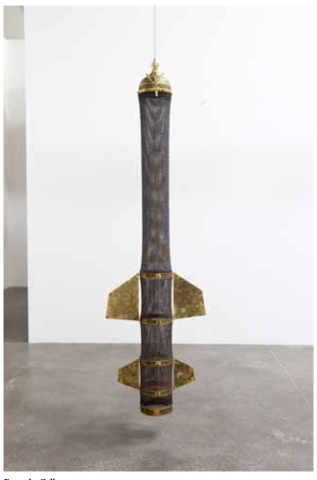
From the Gallery

the projectile, his material being a combination of both classical war-ware and the modern costume of "passion play". The wings of Pouyan's Projectiles are etched with flowers and birds, their bodies made of strings of chainmail, and the helmets of solid metal, carved and inlaid with gold. Indeed, calligraphy and ornamentation are the basic elements of eastern decoration, having long been used to decorate all types of objects, including weapons and armor. They stand as metaphors for the narrow boundary that lies between sophisticated poeticism and extreme barbarism. Looking at these works, phallic symbols of power, we can find the trait unaire that links all of Pouyan's works.