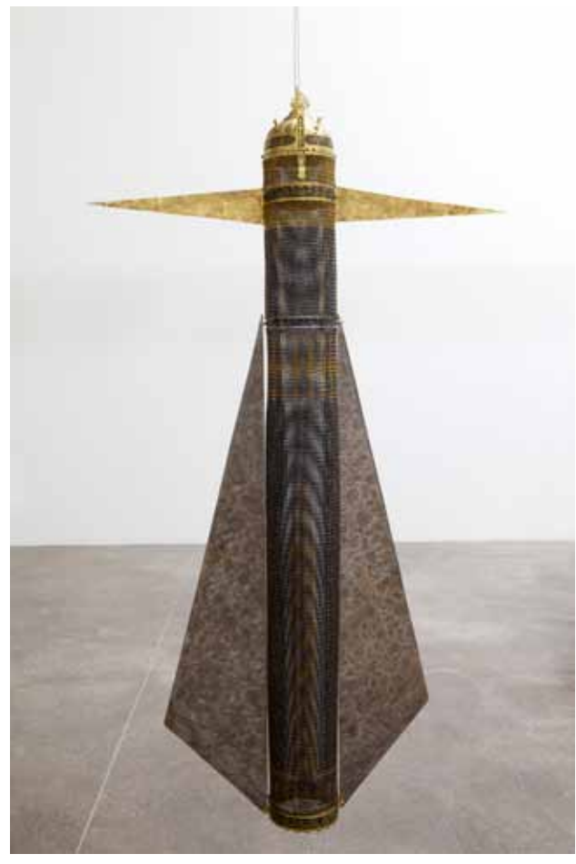
From the Gallery